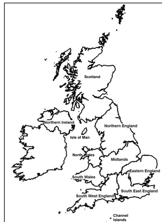
Figure 1: Regional Verification Panel areas

Geographically the Regional Panels are based on Butterfly Conservation's Branch areas, see figure 1; South West Region (Cornwall, Devon, Dorset,